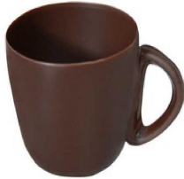
ML Coffee Cup Mini CM-2D 45pcs