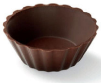
Petit Four Cups Round #3317 240pcs