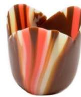
ML Petit Four Tulip Pastel 152pcs PF-2N