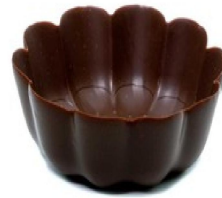
ML Turban Cups 90pcs QD-14N