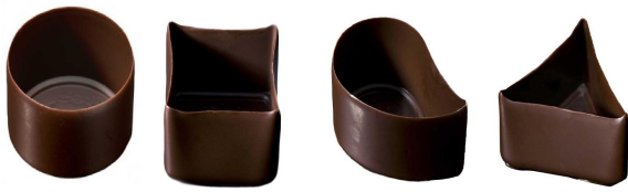
ML Dark Assortment 200pcs QD-17