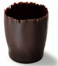
Snobinette Cups 135pcs