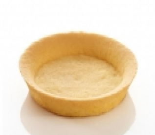
Signature Quiche Shells 8.5cm