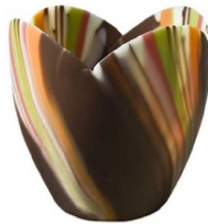
ML Pastel Tulip Cups 36pcs PT-1N