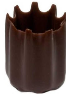
ML Floret Cups QD-15 308pcs