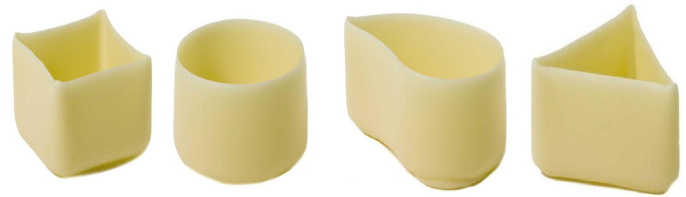
ML Ivory Assortment 200pcs QW-17