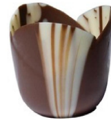
ML Petit Four Tulip Marbled PF-1 152pcs