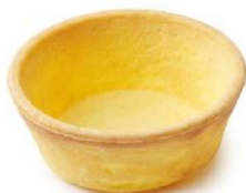
5cm Gluten Free Tart Shell 70pcs