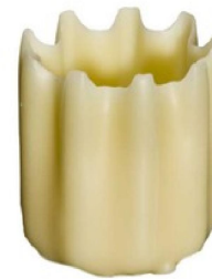
ML Ivory Floret Cups QW-15