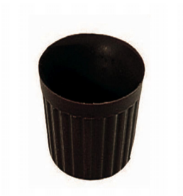
Cream Cups #313 350PCS