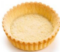
Signature Sweet Tart Shells 9.5cm 108pcs