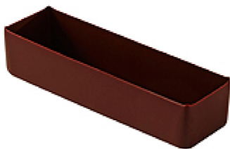
ML Rectangle Cup 100pcs - NEW!!