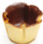
Hafner Chocolate Coated Tulips 72pcs