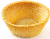
Signature Sweet Telline Mini Tart Shells 4.5cm 480pcs