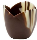
ML Crocus Cup Marble CR-1 72pcs