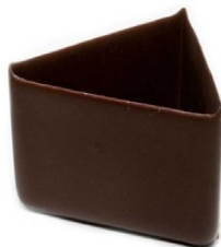
ML Triangle Cups 60pcs QD-7N