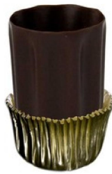
ML Liqueur Cups QD-16 154pcs