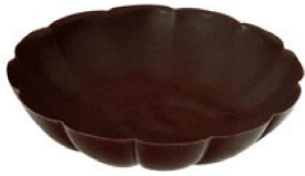
Dessert Cups #375 78pcs