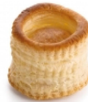
Signature Bouchees 7cm 96pcs