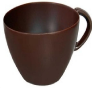
ML Tea Cups TC-1 36pcs