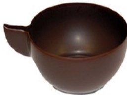
ML Mini Tea Cups TC-2 144pcs