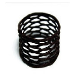
Lattice Towers (Napkin Rings) 50PCS