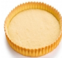
Signature Sweet Tart Shells 22cm 10pcs