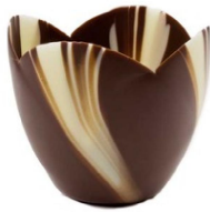
ML Tulip Cups Marble TU-1 36pcs