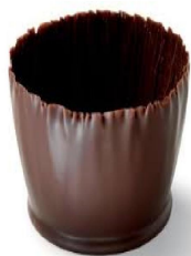
Marie Charlotte Cups 135PCS