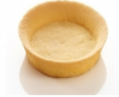
Signature Straight Edge Tart Shells 8.5cm 108pcs