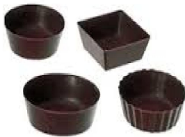
Petit Four Cups Assorted #3302 312PCS